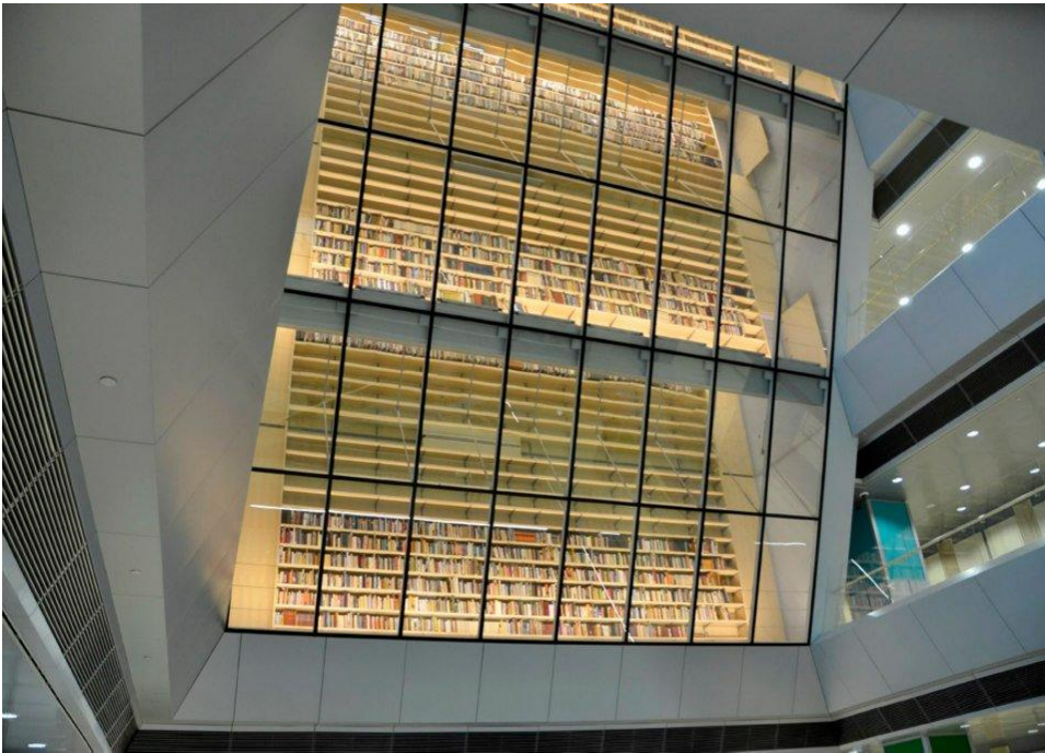
National Library -Riga

09:30 - 11:00 Session III – Cultural Heritage & Investment Law ( The General Legal Framework ) ( Aula Magna )