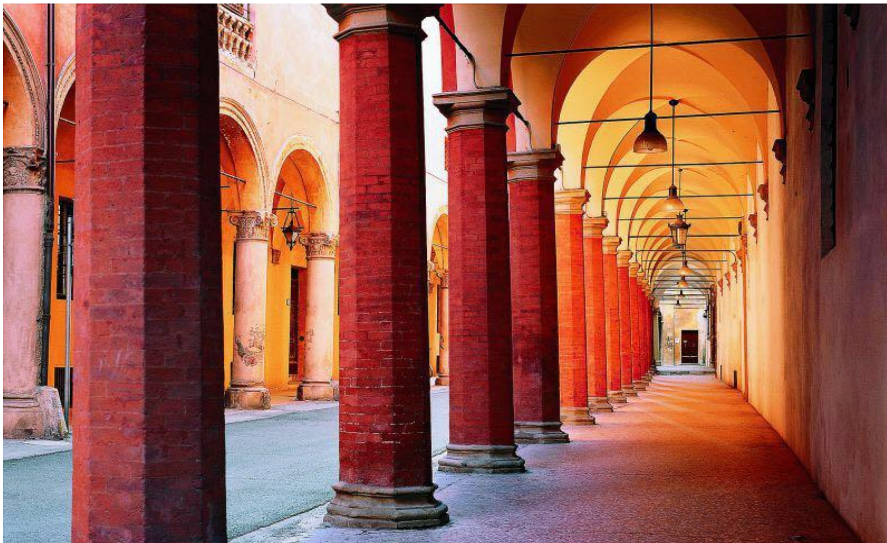
Portici - Bologna