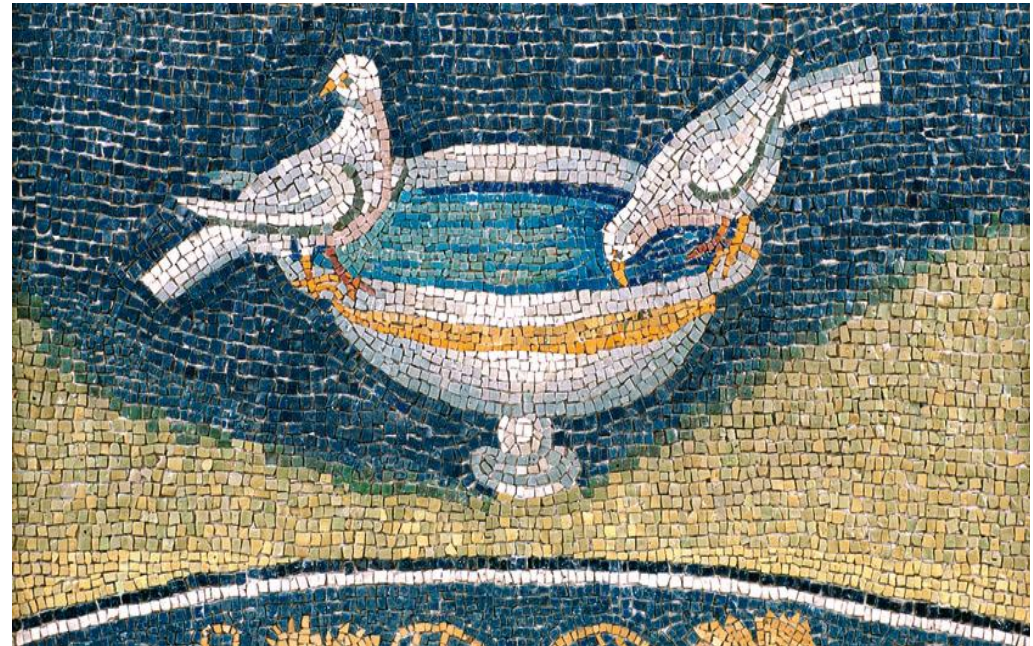
Colombe abbeveranti - Mausoleo di Galla Placidia, Ravenna