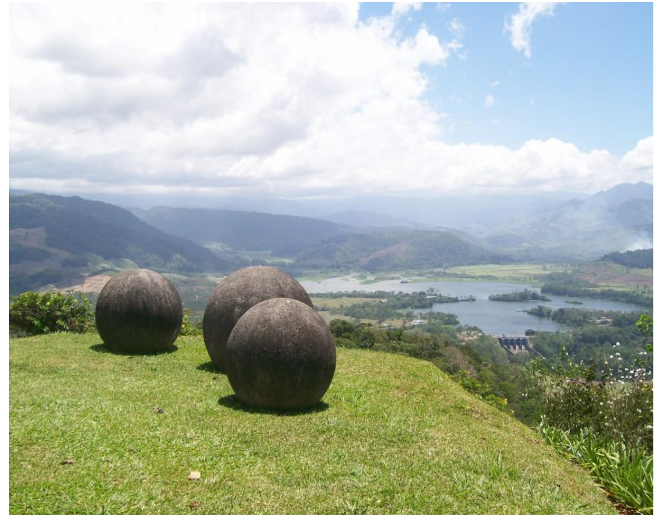
Precolumbian Chiefdom Settlements with Stone Spheres of the Diquís - Costa Rica