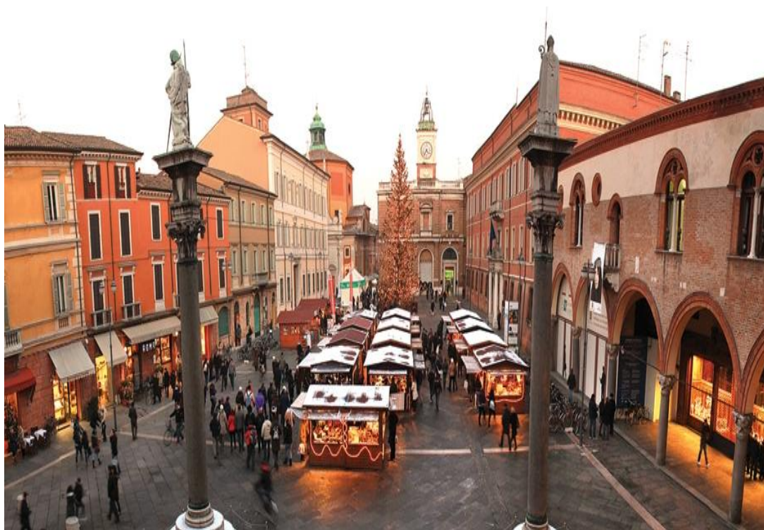
Piazza del Popolo - Ravenna

9:00 - 09:45 Opening Ceremony ( Aula Magna )