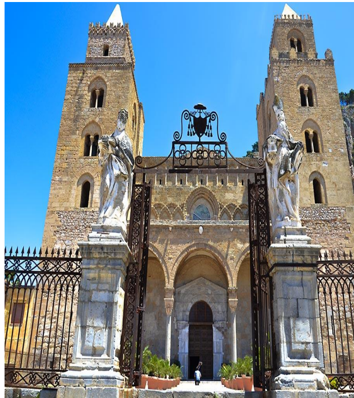
Cattedrale di Cefalù