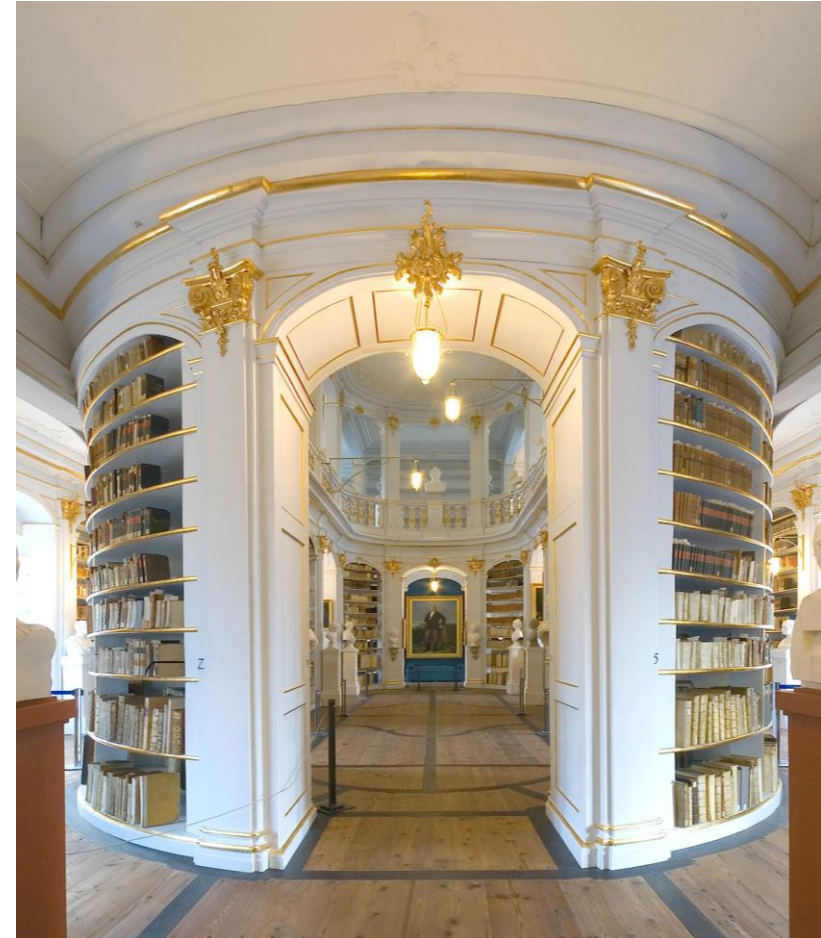
Duchess Anna Amalia Library- Weimar