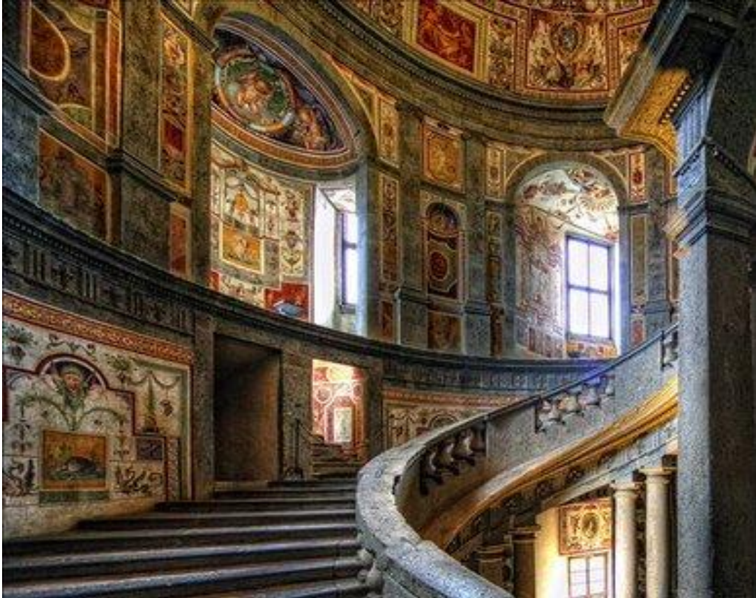
Scala Elicoidale - Palazzo Farnese, Caprarola (Viterbo)