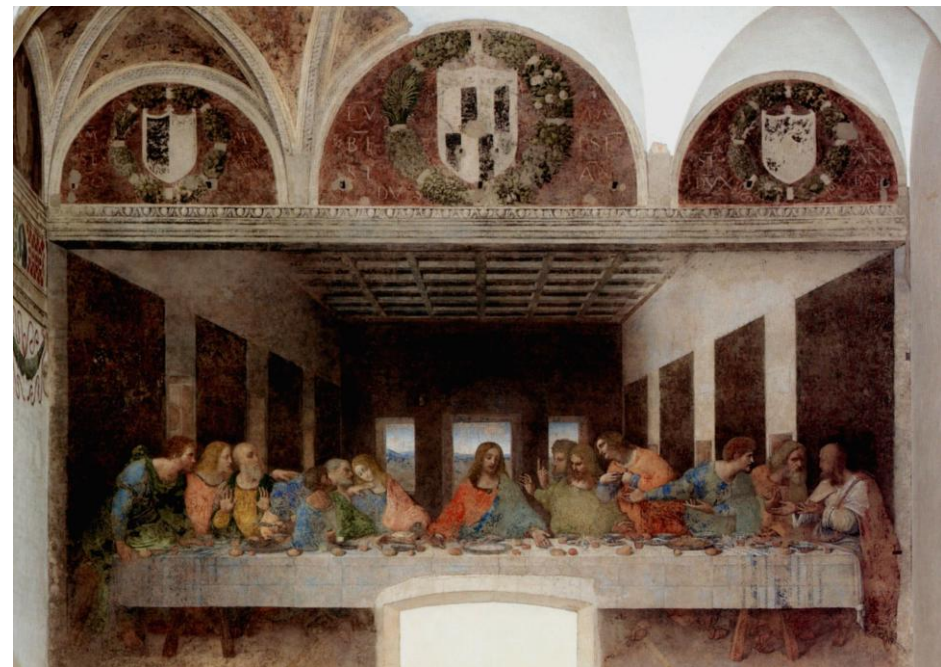
L'ultima Cena (Leonardo da Vinci) – Convento Santa Maria delle Grazie, Milano

His recent experience includes the legal assistance to a leading Japanese museum for the negotiation of a long-term cultural cooperation agreement with the Italian Ministry of Cultural Heritage, for the donation of a painting of Leonardo's School to the Republic of Italy, for several loan agreements for the exchange of cultural property between Italy and Japan on the occasion of Expo 2015 and the first exhibition on the Italian Renaissance in Tokyo.