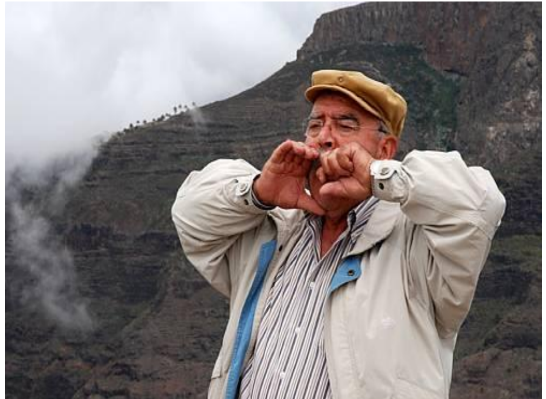
El Silbo Gomero