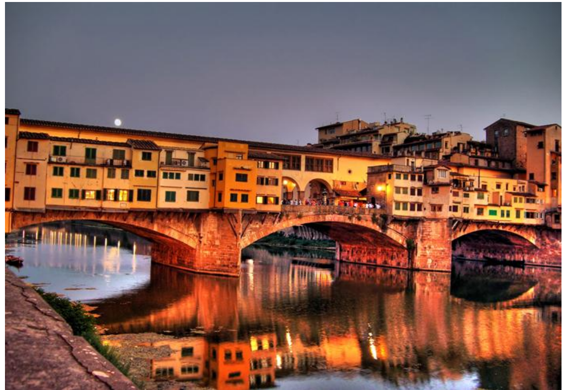
Ponte Vecchio - Firenze