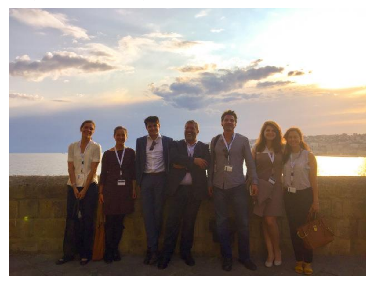
IG workshop in Naples, 6 September 2017

1. On 6 September 2017, the IG organised a pre-conference workshop titled ' The Future of International Migration Law' in Naples in the framework of the ESIL 13<sup>th</sup> Annual Conference. The workshop was hosted by the Italian National Research Council. With about 20-25 participants and a lively panel debates our first pre-conference event was a success. The workshop focused on the realisation of the global public good and fundamental value of international protection of forcibly displaced individuals and the benefits of safe, regular and orderly migration to all actors involved. The panels approached this topic from mainly two angles. Panel 1 discussed whether – and if so, how – a multi-layered and fragmented landscape of actors and legal regimes affects international protection: does a fragmentation of legal tools and policies lead to differences in the level of protection and hence threaten the provision of this public good? Or can legal regimes complement each other and enhance protection? Panel 2 provided a platform for the presenters to focus on what they signal as peculiarities and new challenges in the ongoing responses to the emergency and in what one could call an emerging body of international migration law.