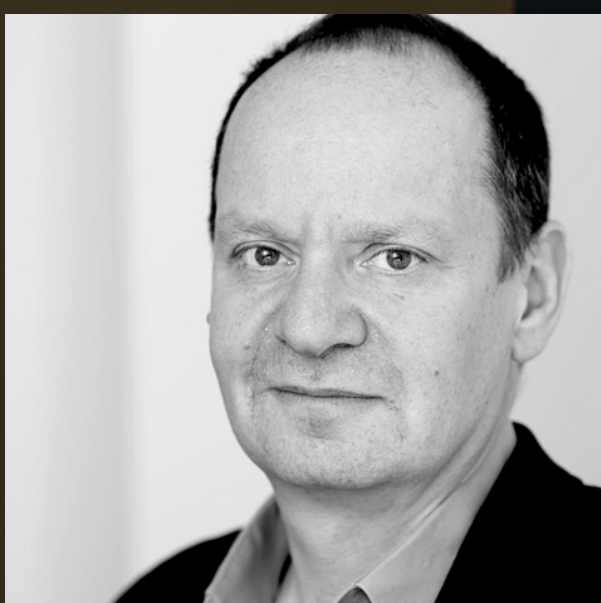
Philippe Sands UCL London